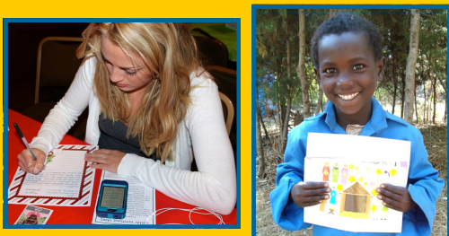
4others Facebook post: "Your Christmas letters were delivered! Check out the photos!"

More than just a new photo every year with an annual update on the child's grade and age, Spring of Hope provides sponsors with frequent updates from the CarePoint leaders, including pictures on Facebook!